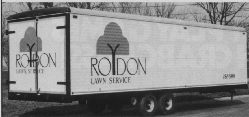
28 FT. WELLS CARGO EXPRESS WAGON

"With a Wells Cargo Behind... You Never Look Back"