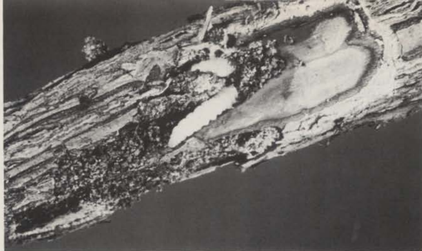
Clearwing moth borers are common in ash, dogwood, flowering fruit trees, lilac, oak and rhododendron. Borer larvae feeds beneath bark.

ing. If the plant is under water stress and aphid numbers are building up, an insecticidal spray should be used to prevent premature leaf drop on valuable specimen trees.