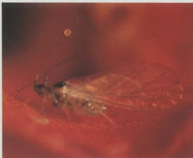
If the plant is under water stress and aphid numbers are building up, an insecticidal spray should be used to prevent premature leaf drop on valuable specimen trees.

Some insect and mite pests are vulnerable to control tactics after plants have become acclimated to winter temperatures. Landscape managers can capitalize on this window of op-