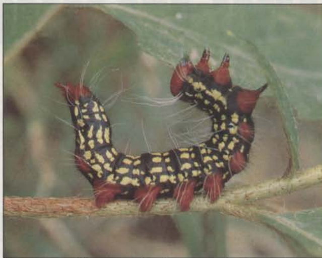
Large caterpillars are difficult to control with insecticides. After they have finished feeding there is little justification for applying one.

Honeydew serves as a substrate for sooty mold fungi that reduce the aesthetic appeal of host plants and limit their ability to manufacture food