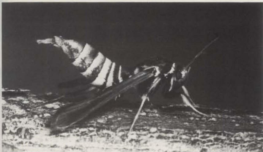
The peachtree borer (a clearwing moth) can be controlled with a single application of Dursban or lindane in late June (in the North) or late August (in the South).

vulnerable to insecticidal sprays until the following spring when new buds open.