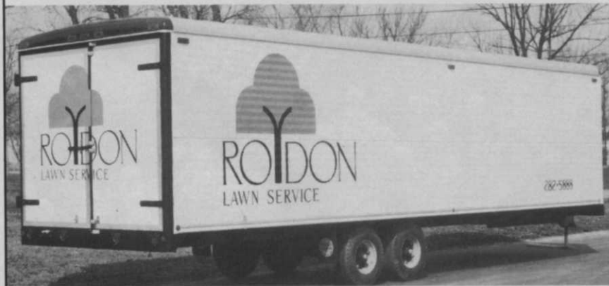
28 FT. WELLS CARGO EXPRESS WAGON

"With a Wells Cargo Behind... You Never Look Back"