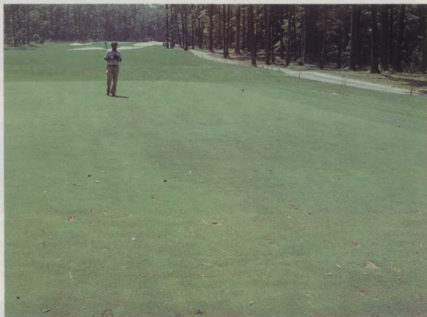
Phosphorus deficiency on creeping bentgrass. The turf has thinned to a wilted, purplish appearance that could be mistaken for drought stress. This turf will green up slowly in the spring.