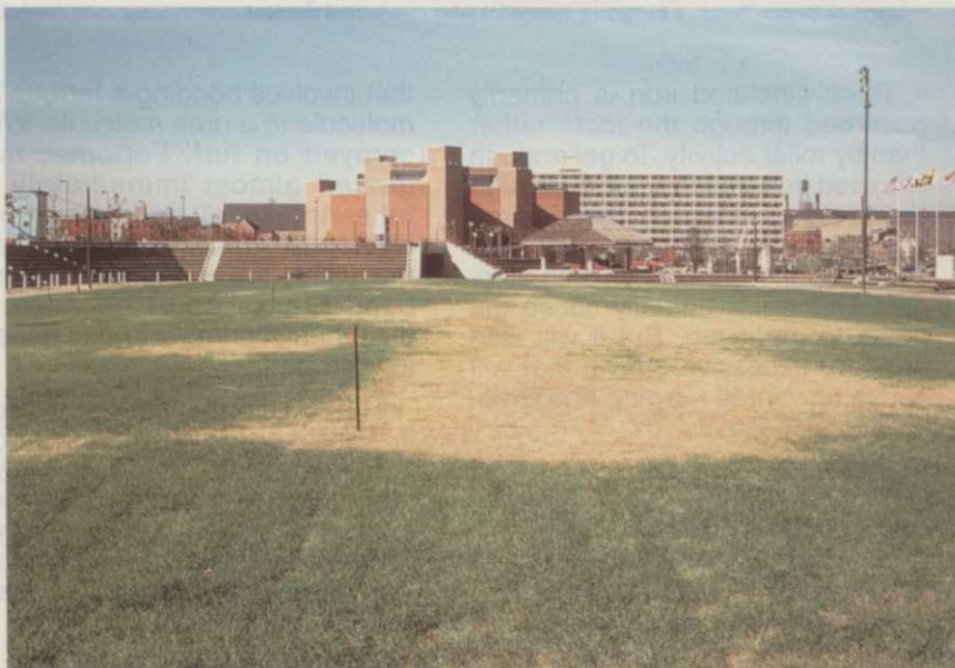
Sod damaged two weeks after installation due to high soluble salts. When soil testing for new sites, obtaining a soluble salts test in addition to the regular test can prove very valuable.

Large differences exist among the turfgrass species in nitrogen rate re-