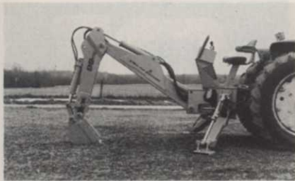
Circle No. 201 on Reader Inquiry Card

Other options include: externally capped hydraulic cylinders with replaceable hardened steel wear bushings; SAE 100 R-2 hydraulic hose; o-ring ports; high strength alloy steel tapered section bucket.