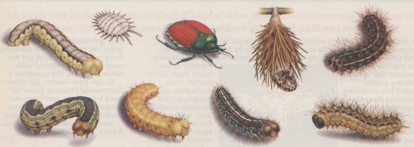
Top row: Leaf-feeding caterpillar, Mealy bug, Japanese beetle, Bagworm, Gypsy moth. Bottom row: Cankerworm, Leaf skeletonizer, Tent caterpillar, Webworm.