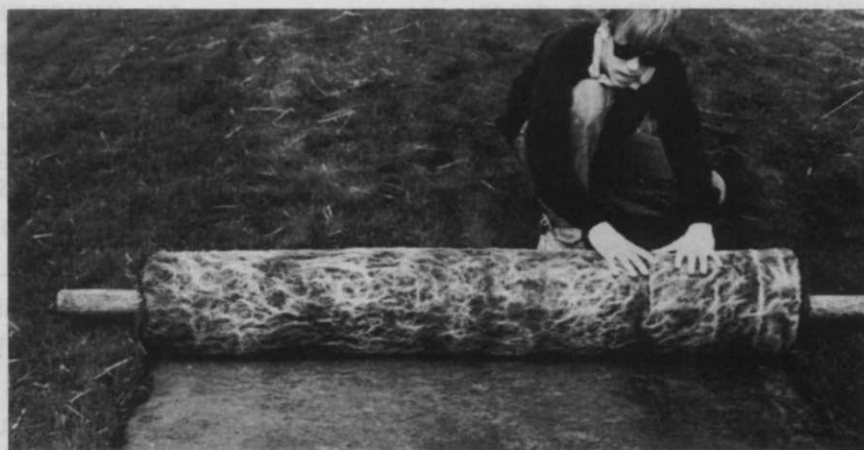
The availability of composted sludge and the arrival of tall fescues make the concept of growing sod over an impermeable base more feasible.

growing material in a thin layer evenly over acres of plastic film without distortion is a challenge. Rainfall — whether it be a drizzle or a downpour — compounds the problem.