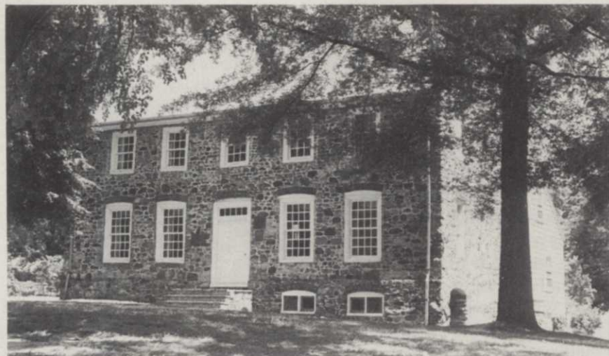
At the southernmost tip of Staten Island is the Conference House, the site of a failed attempt to strike peace between the Americans and British in 1776. This year 13 native black tupelos were planted here, one for each of the original colonies.

In Central Park's Strawberry Fields, a white pine was planted to commemorate the historic role of the Iroquois Six Nations, whose constitution served as a model for the U.S. Constitution. The Iroquois Six Nations are the oldest continual constitutional government on this continent. The first treaty George Washington signed with another government was with the Iroquois Nations in 1768, when the United States officially recognized Iroquois sovereignty. LM