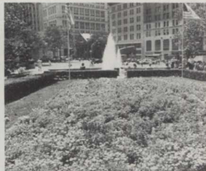
Today it's a pleasant park in the heart of Manhattan where one can go to enjoy lunch. But only 200 years ago, City Hall Park was a hotbed of revolution, a site that hosted military barracks and Liberty poles. Ageratums, pansies and begonias planted this year bring the present and past together beautifully.

once the front line of battle in the Revolutionary War. Groves of green mountain sugar maples were planted at John Paul Jones Park in Brooklyn and at Rufus King Manor in Queens, the former home of a drafter and signer of the Constitution.