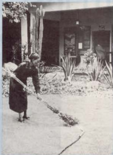
African ingenuity: a broom made of tree branches is used to remove footprints from the clubhouse lawn.

I think we have a lot to learn from the East Africans, if only to bring ourselves back to earth once in a while to realize how fortunate we are in so many ways. Yet, since they can produce the same results,