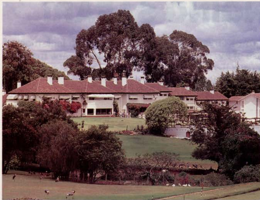
At an altitude of 7,000 feet, Mt. Kenya Safari Club stays cool in times of dire heat yet lies just beneath cloud cover.

tion in horticultural and landscaping practices is what they are taught by the superintendents.