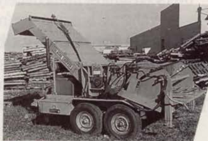
Model 864 — Gets volume reduction of pallets and wood debris for increased disposal capacities

■ Olathe Chippers reduce bulk — cuts down time to landfill sites. Provides mulch for safety and beautification programs. Olathe manufactures five models to handle your chores — from 8 hp 2½" capacity to 100 hp 12" diam. capacity. With units in the field for over 15 years, Olathe keeps proving itself as a leader in the chipper field.