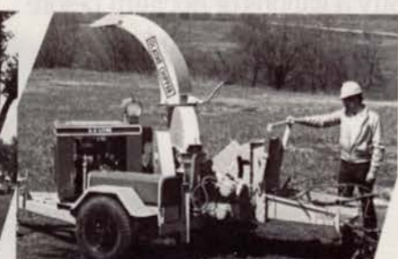
Model 986 — Hydraulic feed disc chipper features: 12" capacity, variable feed rate, gas or diesel, and 15° curbside feed angle for safety.

Write or call your local Olathe/Toro dealer for free demo or call 1-800-255-6438