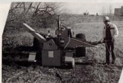
Model 12 — PTO, 3 pt. hitch or tow-type, 7" capacity, 500 lb. drum