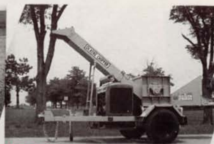
Model 816 — Debris chipper handles kiln dried lumber and assorted wood debris.