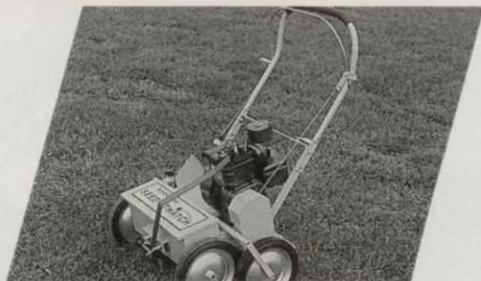
MODEL 85 — 5 hp Seed 'n Thatch, low cost combination thatcher/seeders.

With Olathe Slit Seeders you: • use less seed • get higher germination rates • have a healthier root system • thin out thatch and undesirable species • provide safer turf for sport areas • achieve the most important goal in over-seeding, namely, seed to soil contact.