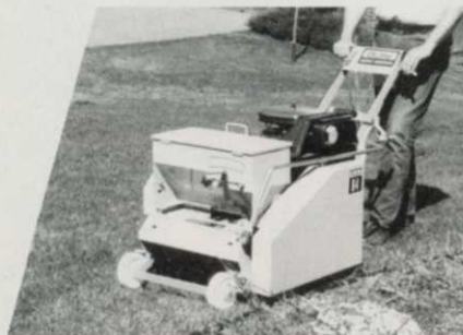
MODEL 84 walk-behind slit seeder, 18 hp, self propelled.