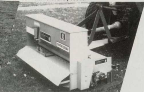
MODEL 83/93 — 4' PTO model for tractors 25 hp and up. In 1962, Buck Rogers built the first Rogers Slit Seeder. Now, in 1989, he has improved and expanded on his original ideas under the Olathe trademark.

Write or call your local Olathe/Toro dealer for information.