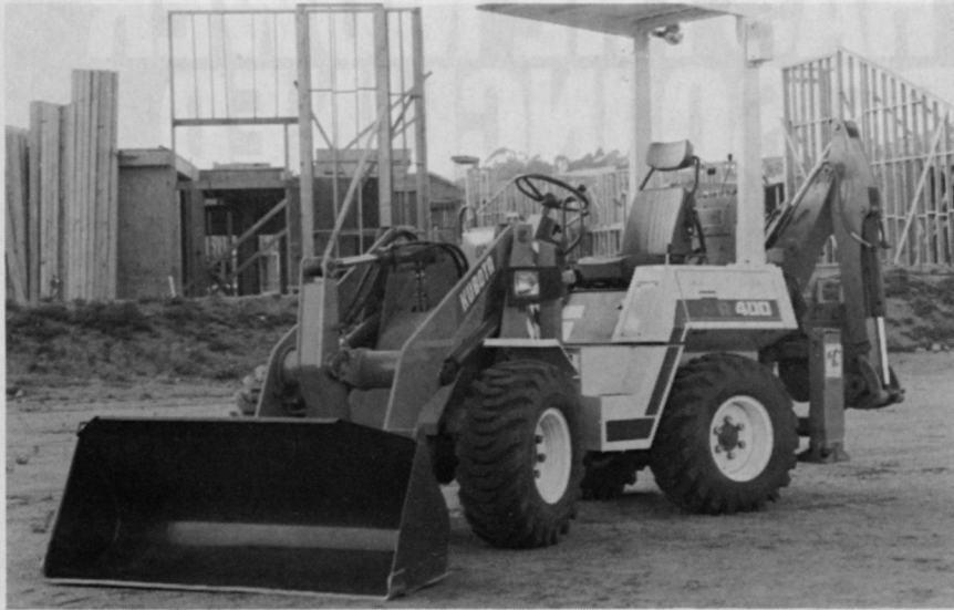
An example of vehicle flexibility is Kubota Tractor Corporation's R400, which is suitable for both commercial and industrial use.

equipment commonly found in grounds-care fleets;