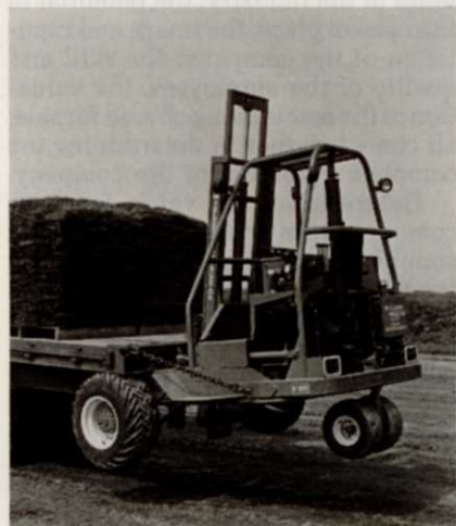
The Piggyback weighs 3,500 lbs. and can lift and load up to 5,500 lbs. It

The Piggyback Material Handler from Teledyne Princeton lifts and loads sod and other landscape material and then loads itself onto a truck or trailer for transport home.