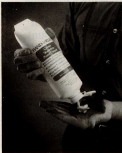
Circle No. 196 on Reader Inquiry Card

Hand-Y-Kleen is designed for pesticide applicators, growers and landscapers.