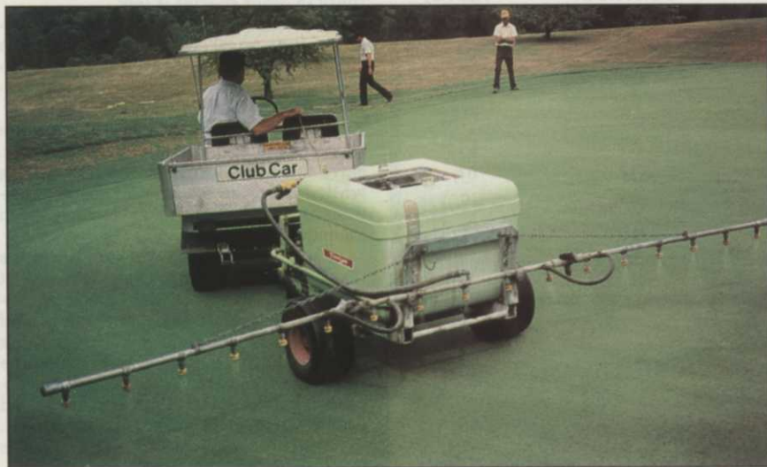
A golf course superintendent applies parasitic nematodes to the green.

Knowing the life cycle of pests is at least as important as selecting an insecticide for their control. This guide points out the seasonal occurrence of some important cool- and warm-season pests to be alert for in 1988, when their vulnerable stages occur, and some suggested insecticides that may be used to control them. No endorsement of products is intended, nor is criticism implied for those not mentioned.