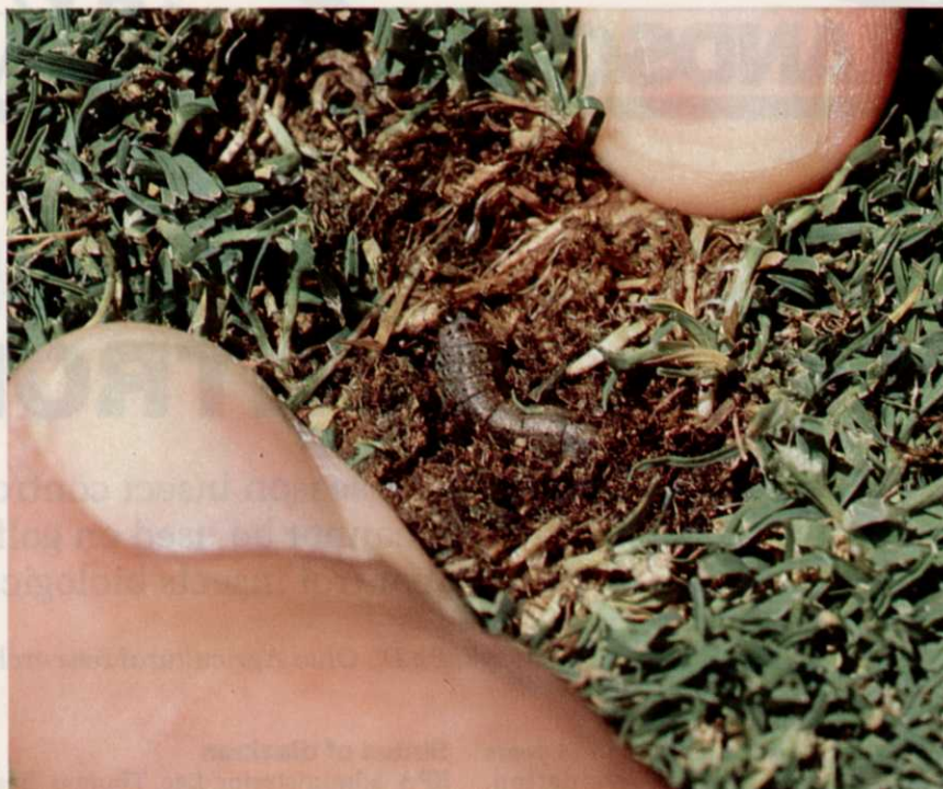
Pulling back the turf on a green can reveal hidden cutworms.

Chinch bugs and billbugs —As warm days of spring approach, movement of chinch bug and billbug adults increases rapidly. Generally, egg laying begins the first week