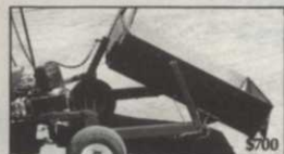
$700 DUMP BOX

The Dakota Hand is made specifically for resorts, golf courses, apartment complexes, hobby farms, parks, nurseries, municipal and state facilities, and for rentals, landscapers or soil conservation.