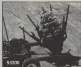
$3200 TOWABLE TRANSPLANTER