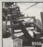
$550 LOG SPLITTER

Also Available POST HOLE DIGGER and SPREADER