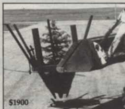
$1900 BUCKET or 3-POINT MOUNT TRANSPLANTER