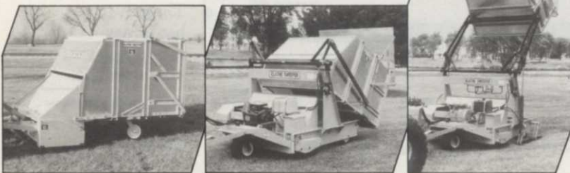
Model 65 PTO-powered 5' width

Olathe personnel have been helping solve leaf/debris problems for over 30 years. Ranging in size from our model 42 (36" wide, 5hp tow-behind) to the large area tow units which are the 166e, the 166hl and the 65 PTO (all with 5' width, 5 cu. yd. capacities). Ground and high lift models.