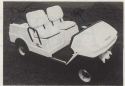
Circle No. 200 on Reader Inquiry Card

Columbia's 1988 model Par Cars include a new dashboard with easy access to key-controlling forward/reverse directions, shorter length for improved maneuverability, dura-spike long life floor mats and improved, long-wear individual bucket seating.