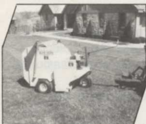
Model 42 tow — type, 1/3 cu. yd. 5 hp, 3' swath, finger or brush reels.