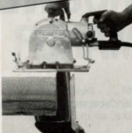
U.S. Patents Nos. 4309931, 4464964, 4562761. Other Patents Pending

The LINEAR LINK™ Model WE 90/WD offers these special features: