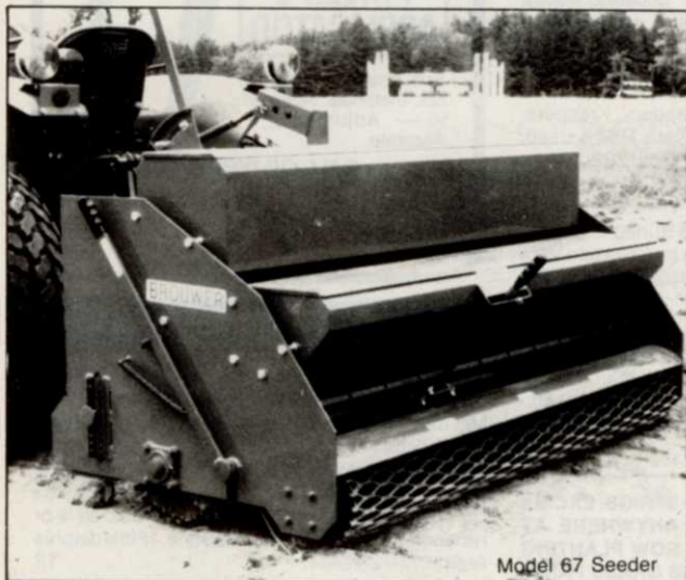
Model 67 Seeder

ATTENTION GOLF COURSE SUPERINTENDENTS: Great Meyer Zoysia for your Fairways and Tees. Guaranteed Bermuda free. Beauty Lawn Zoysia (Cincinnati) 1-513-424-2052. 3/89