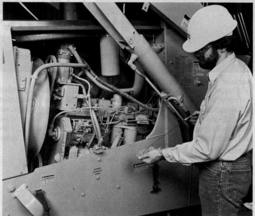
Unexpectedly low oil levels are a sign that a leak needs attention. Excessive oil use or very dirty oil is a cause for concern.

Peterson is a service engineer at JI Case in Racine, Wisc.