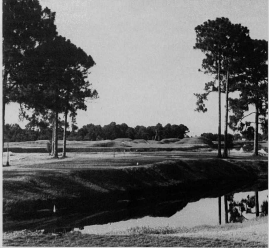
Shown here is hole No. 5 while under construction. That hole has been made even more difficult by a man-made marsh surrounding it.

"Everybody here in South Florida has problems with draining their greens. But Old Marsh is using a method preferred by Dye that has