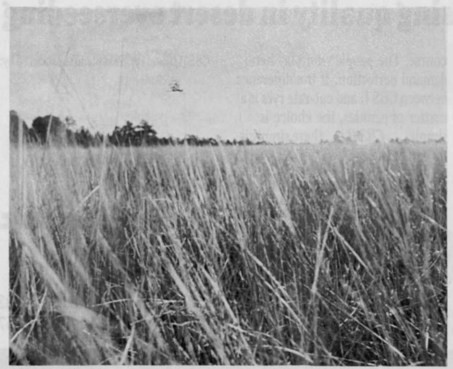
Old Marsh has five preserved natural wetlands bordering the course.