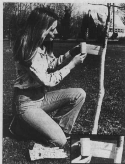
Circle No. 198 on Reader Inquiry Card

Product Demonstration Available on Video