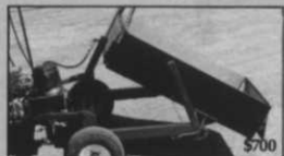
$700 DUMP BOX

The Dakota Hand is made specifically for resorts, golf courses, apartment complexes, hobby farms, parks, nurseries, municipal and state facilities, and for rentals, landscapers or soil conservation.