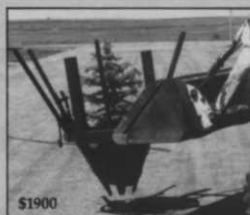
$1900 BUCKET or 3-POINT MOUNT TRANSPLANTER