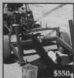
$550 LOG SPLITTER

Also Available POST HOLE DIGGER and SPREADER