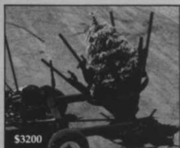
$3200 TOWABLE TRANSPLANTER