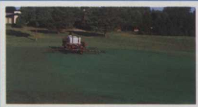
Turf Mark™ turf colorant defines broadcast treated areas on grass, turf, etc.

Easy-to-see B-U colorants indicate chemically treated areas, spots, strips and spray patterns — even spray drift.