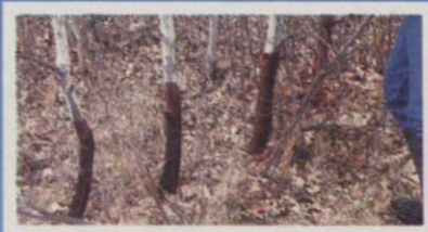
Bas-Oil™ hydrocarbon soluble basal dye promotes tree and brush application accuracy.