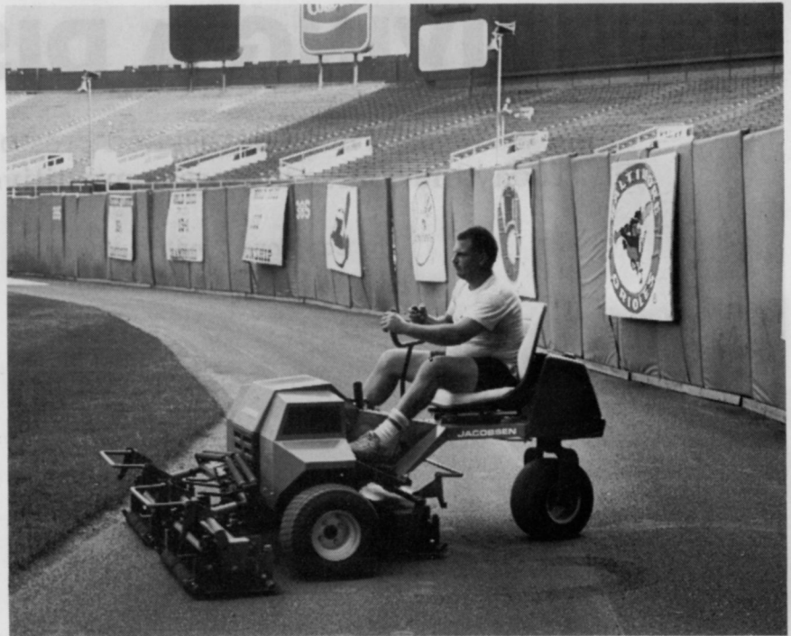
The field at Municipal Stadium in Cleveland is mowed regularly, so that no more than one-third of the grass blade is cut off at any one time.