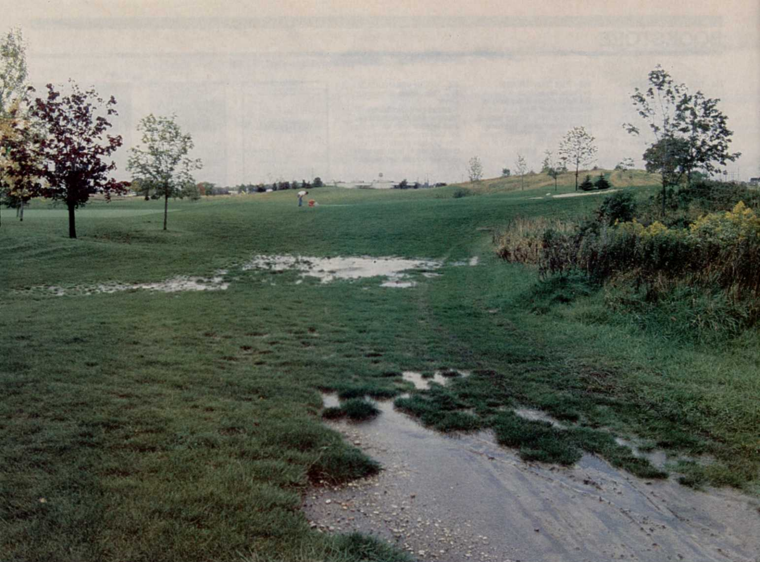
Besides traffic problems, the walkway between Brynwood's 14th and 15th holes suffered from bad drainage.