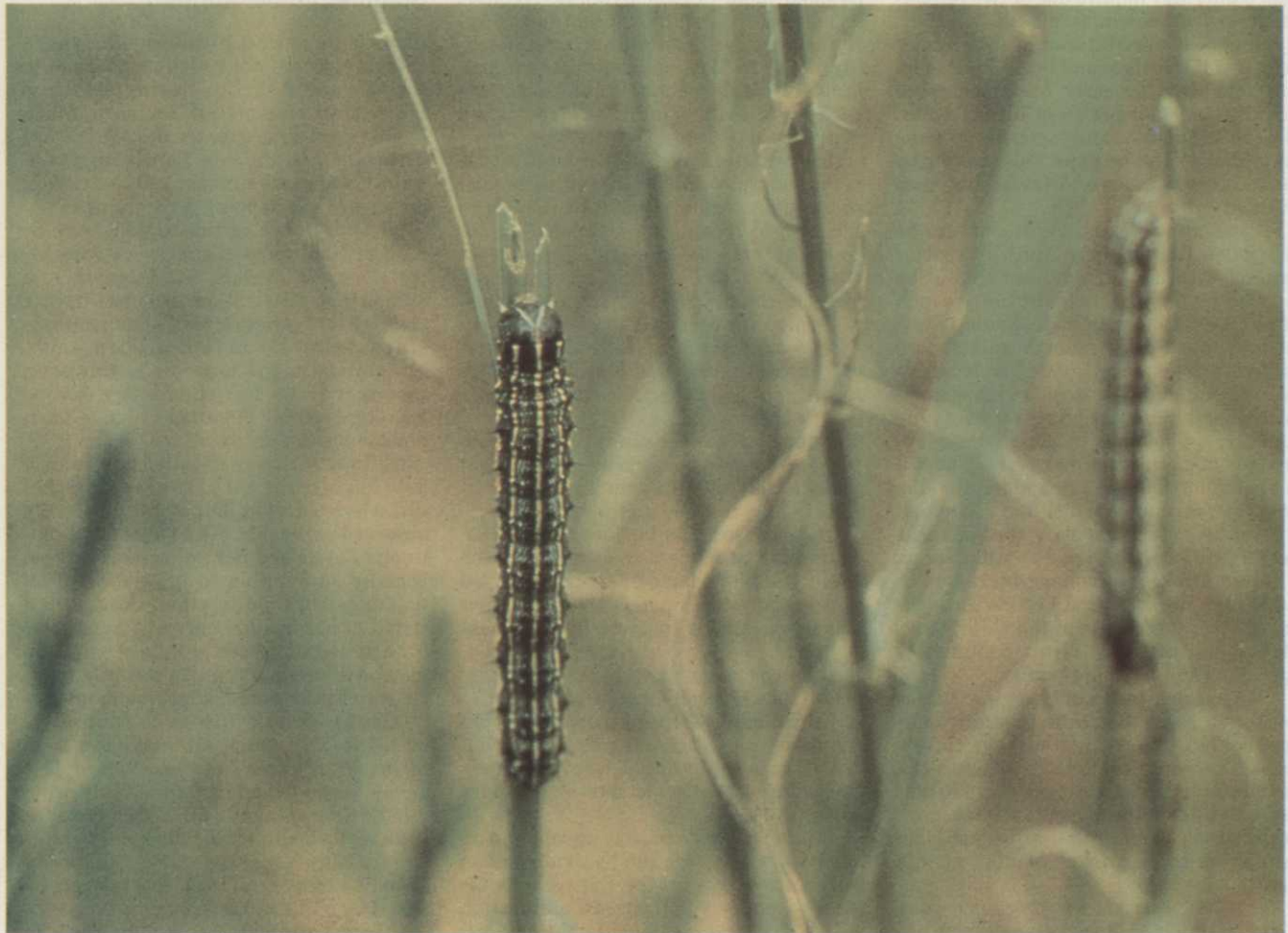
The fall armyworm attacks newly established turf from mid-September through October.

Generally, application of insecticides to prevent buildup of chinch bug and billbug populations should be completed by mid-April in the South. Such applications are