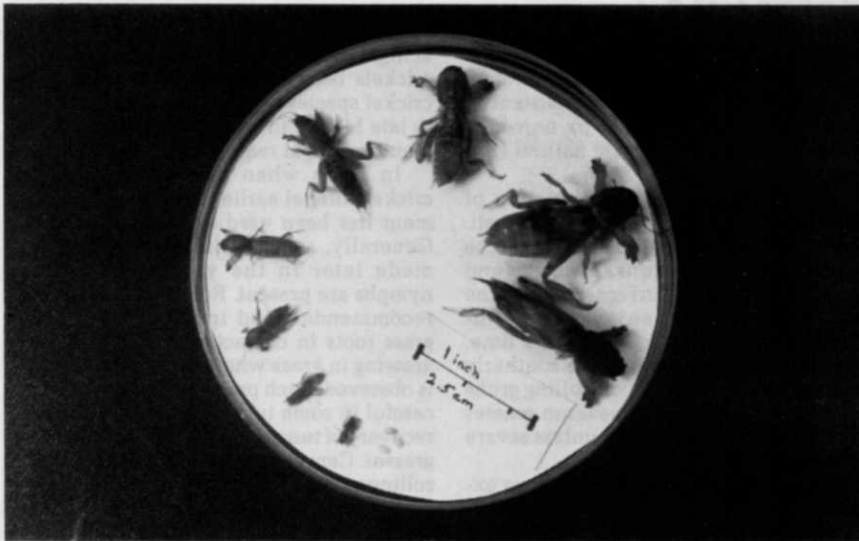
The timing of mole cricket treatments is critical in preventing development from egg to adult.

made before significant numbers of eggs are laid. This time may vary as much as a week or more depending on the spring weather. When this approach is not used and southern chinch bugs are detected in May, treatment provides control. In areas with three to five chinch bug generations, turf surrounded by infested, untreated host plants may require one or two retreatments at six-week intervals.