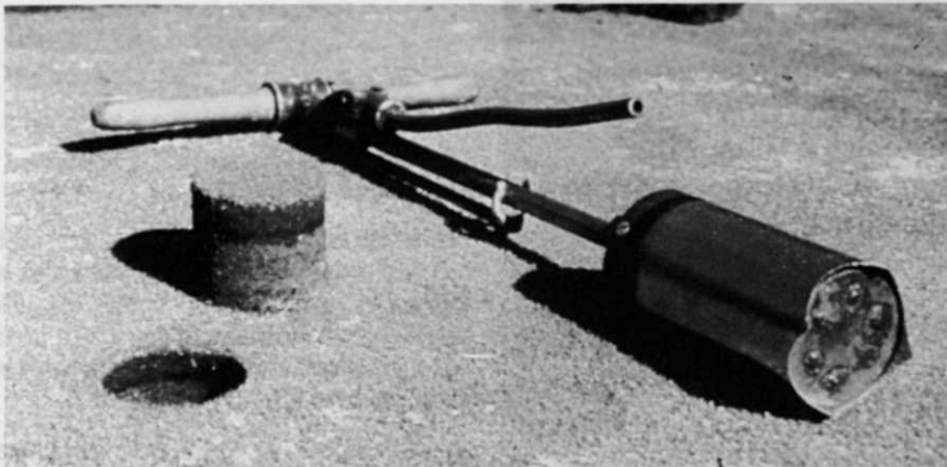
Photo 1: Black layer usually occurs about one-half to three inches below the green's surface.