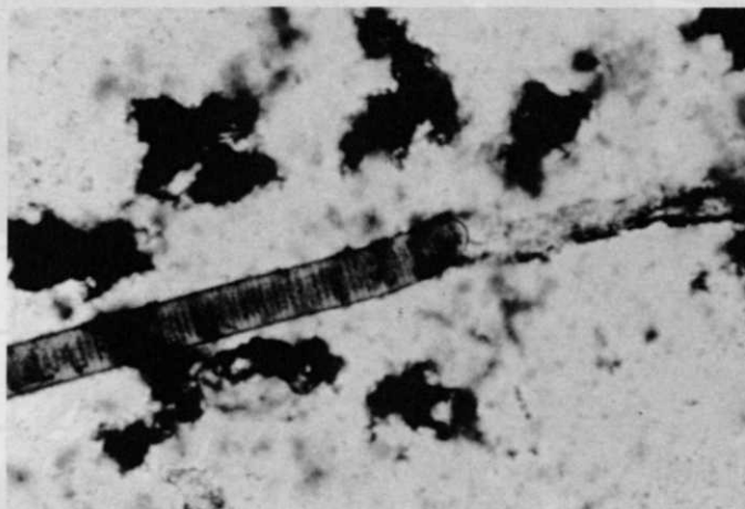
Photo 2: Species of blue-green algae in the genus oscillatoria glide on extracellular mucilage produced by the algal organism.

The black-layer condition initially was viewed as a curiosity and was thought to be peculiar to specific problems on that course. It also was thought to be associated with the green's physical components. From 1978 to 1984, however, the number of black layer samples received in my laboratory increased dramatically,