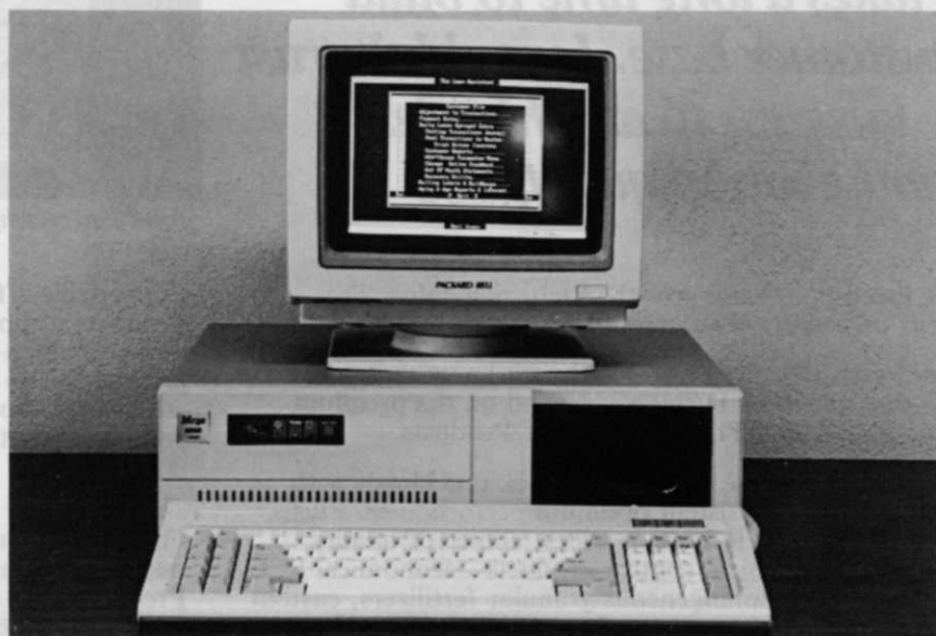
The Lawn Assistant from Real Green focuses on the operations side of lawn care.

Even with all this sophistication, it is usable by companies with as few as 500 customers. LM