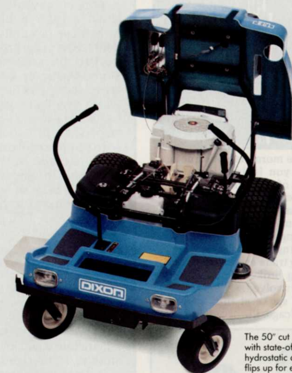
The 50" cut ZTR 501 with state-of-the-art hydrostatic drives. Top flips up for easy service access.

The landscape technician program is a two-year or 4,000-hour program while the landscape management program takes one year or 2,000 hours. Both programs require on-the-job training and 140 hours of classroom training, which is not paid for by the employer.