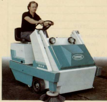
Circle No. 143 on Reader Inquiry Card

TENNANT® 215 cleans 46" path, 70,000 square ft./hr. More than 20 times faster than hand methods, 4 times faster than walk-behind models. Compact, maneuverable for cleaning congested areas. Excellent dust control. Multi-level hopper dump optional. 8 hp gas or LP engine or 36 V. battery power.