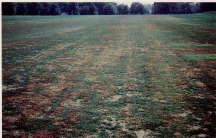
New strains of pythium are more aggressive than older, wild type strains.

The plants that were infected by L. korrae in the cooler weather are in a weakened condition and are very susceptible to summer heat stress or drought stress. Subjecting the necrotic ring spot plants to either of these stresses will lead to the death of the weakened plants and the recurrence of symptoms, even though the pathogen may not be active at this time. The symptoms during cool weather are patches six inches to two feet in diameter with straw- to red-colored blades intermingled in the patch.