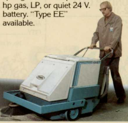
Circle No. 144 on Reader Inquiry Card

TENNANT® 186 sweeps 6 times faster than pushbrooms; covers 34" path, up to 18,000 square ft./hr. Heavy steel wraparound bumper; reinforcing throughout. Powerful brush/vacuum system for nearly 100% dust control. Converts to scrubber in minutes. Removes grease, dirt, oil, other spillage — in one pass. Choose 8 hp gas, LP, or quiet 24 V. battery. "Type EE" available.