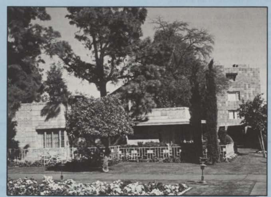
A guesthouse like the one in which Clark Gable and Carole Lombard may have stayed.

With an annual budget of $800,000, Reany oversees a crew of some 32 greenkeepers, equipment operators, mechanics, foremen and laborers. His equipment inventory includes seven riding mowers for maintaining greens, two hydraulically-driven reel mowers used on fairways, two rough mowers, two triplex mowers for