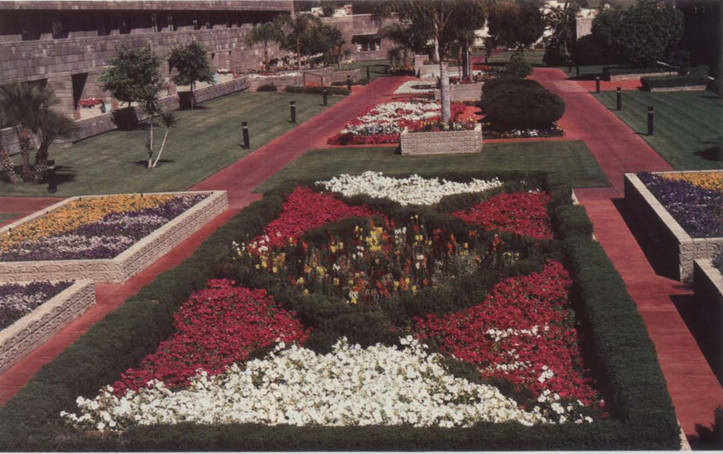
A bird's-eye view of a flowery courtyard at Phoenix's five-star Biltmore Hotel.