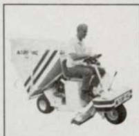
MODEL 80 Sweeps 48" wide. 3 wheels for short turning radius.