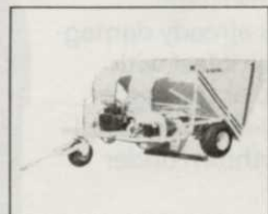
MODEL FM-10 Sweeps 116" wide. Both engine and PTO models available.