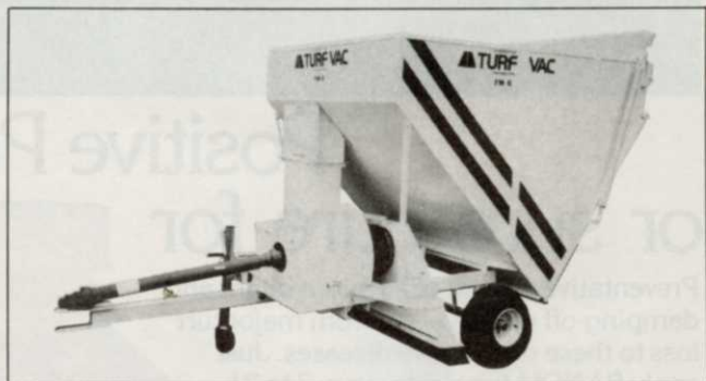
MODEL FM6 PTO. Fast, powerful sweeper tows behind PTO tractor. Vacuums up bottles, pine cones, heavy thatch. Sweeps 60" wide. Hopper capacity 5 cu. yds. unmulched material. Ground dumps.

TURF VAC CORPORATION P.O. Box 90129, Long Beach, CA 90809 Telephone: (213) 426-9376