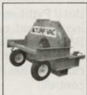
MODEL FMB Front mounted blower with easy on-the-go right & left discharge.