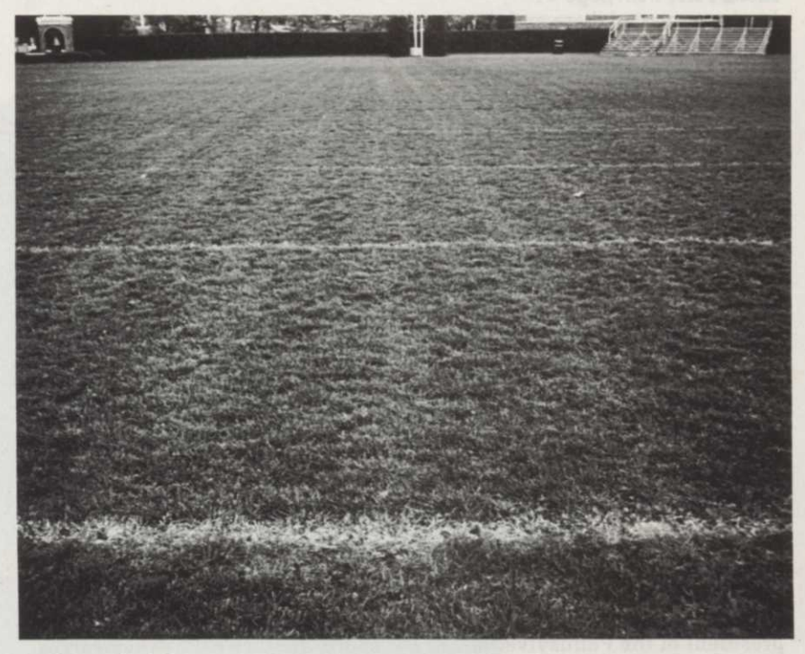
At the end of the season, after 11 games, two played in downpours, there were no visible signs of heavy wear down the middle of the field.