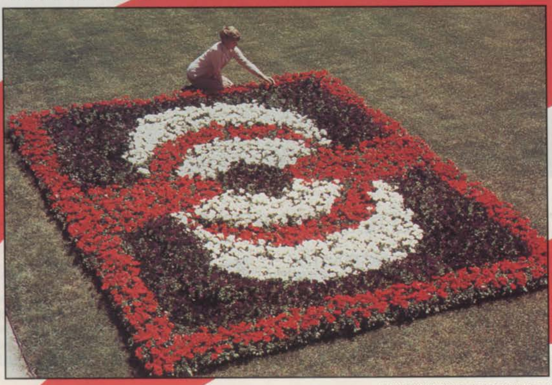
JULY 1987/LANDSCAPE MANAGEMENT 41