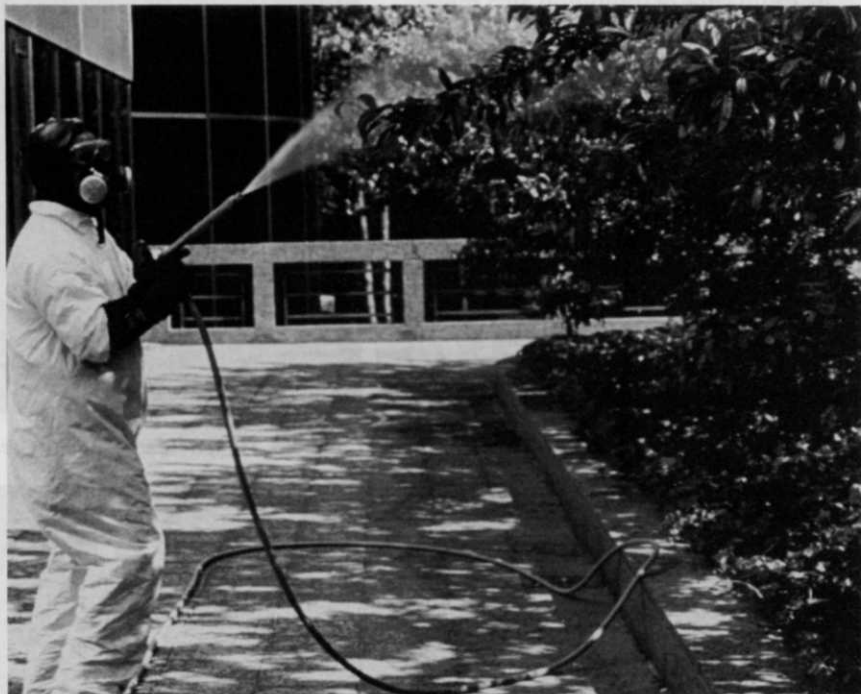
A worker sprays trees near the entrance of Mobil Oil's Fairfax, Va., facility.