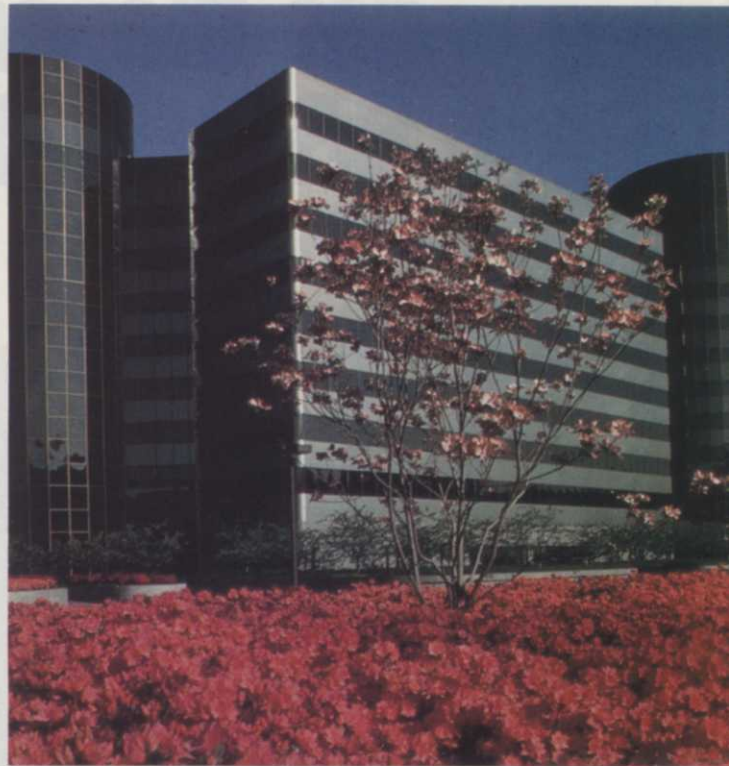
Mobil Oil's marketing and refining headquarters in Fairfax, Va., is located on 126 acres. Just 18 acres boast turf while the remaining acreage is natural woods.

"It doesn't stop at the front door," Ayres says. Elaborate interiorscapes blend the outside with the offices inside. "We try to provide a healthy environment for the employees," Ayres says. "If they're happy, they'll perform better."