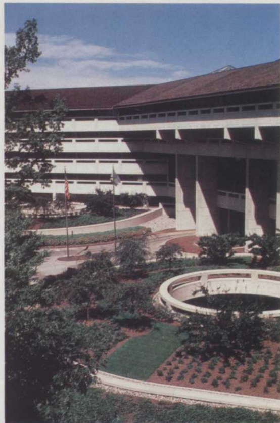
AT&T's award-winning Basking Ridge, N.J., facility features eight terraces rising above underground parking garages. The courtyards feature many trees including cherry, locust, maple, crabapple, and white and black pine.