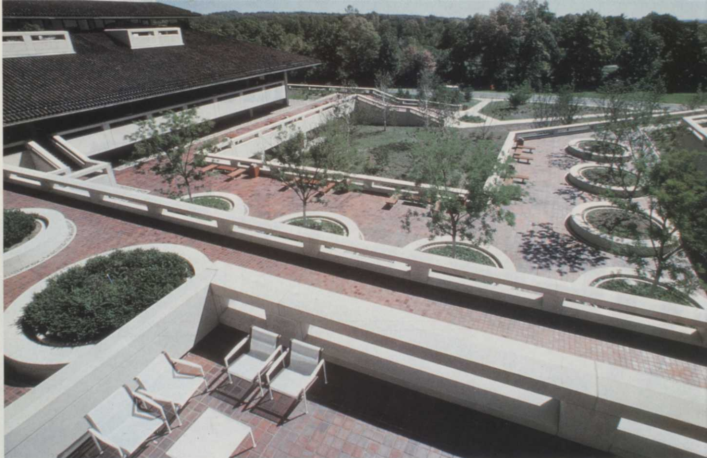
A view of the courtyards at AT&T's Basking Ridge site. There are 1,200 trees on the 126 acres of land.