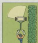
Spread pattern with trim control*