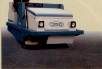
Circle No. 175 on Reader Inquiry Card

Exclusive II-SPEED™ sweeping with unsurpassed pick-up! Use standard speed for debris from sand to bricks and get up to 1/3 longer brush life than competitive makes. Switch in seconds to high velocity for light litter, paper, pine needles. Sweeps 53" path. 2-year/2,000 hour factory warranty (except normal wear items).