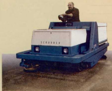
Circle No. 176 on Reader Inquiry Card

Covers 50" path, 50,600 sq. ft./hr. Twin high-speed brushes with aggressive scrubbing action remove spills, stains, and soilage. Applies solution, scrubs, and picks up in one pass, leaving floors clean and squeegee-dry. Twin 20 gallon tanks hold 40 gallons solution.