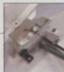
Adjust both the pattern and product flow*