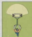
Spread pattern without trim control*