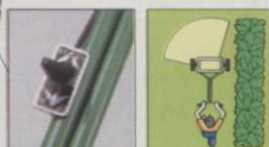
Handle mounted on off trim control* (optional)