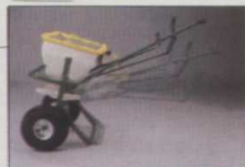
3-way height adjustment*

The best got even better! It was tough, but we've found a way to improve the best broadcast spreader on the market: first, add our patent pending trim control device* and, second, make the height adjustable for operator convenience. Best of all, both improvements are retrofitable to our classic CB-85.