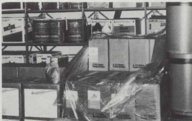
A number of unsafe chemicals have been banned from the market during the past 25 years, but one thing which hasn't changed is safety in chemical storage.