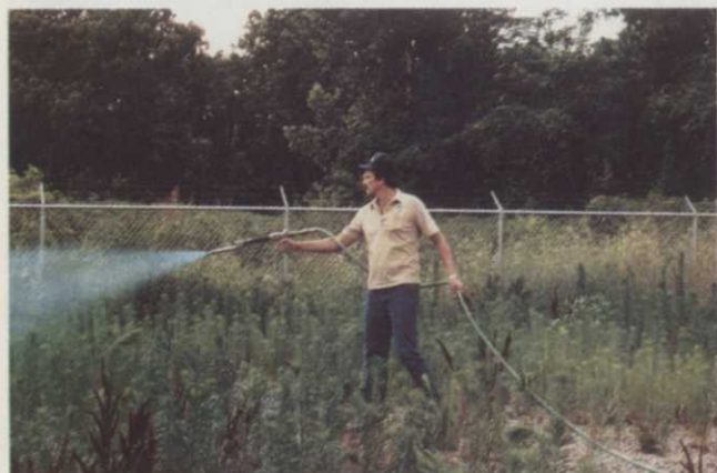
Spraying remains a primary means for application of chemicals.