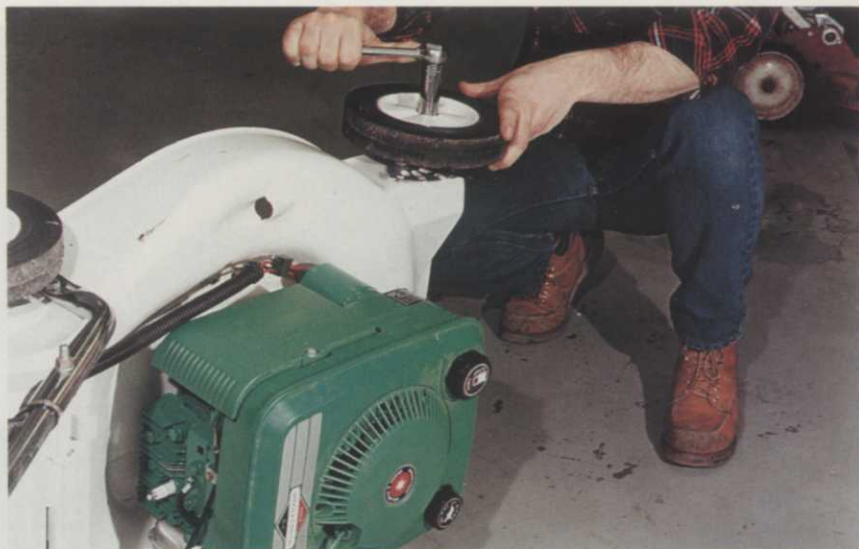
Routine maintenance will help you protect your investment in your mower and keep it running like new.

Two-cycle engines are lubricated by oil mixed with the fuel. Oil-to-fuel ratios vary considerably among different brands. Typical are ratios from 1:16, 1:20 and 1:25 all the way up to 1:50. Four-cycle engines have a crankcase or sump which must contain the proper amount of oil to bathe the moving internal parts while running. The engine type used is largely a matter of the equipment manufacturer's choice