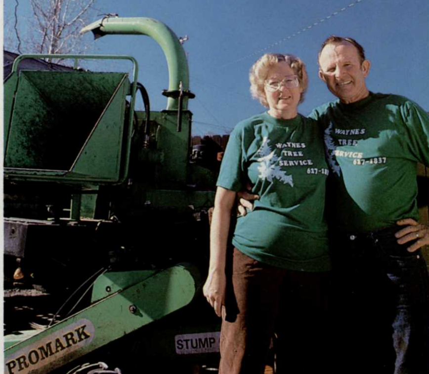
Circle No. 138 on Reader Inquiry Card

Promark Products, Inc. 330 9th Avenue City of Industry, California 91746