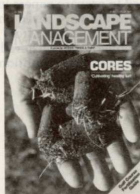
ON THE COVER: Excellent soil cores removed by a tine aerator.

LANDSCAPE MANAGEMENT, formerly WEEDS TREES & TURF, (ISSN 0894-1254) is published monthly by Harcourt Brace Jovanovich Publications. Corporate and Editorial offices: 7500 Old Oak Boulevard, Cleveland, Ohio 44130. Advertising Offices: 7500 Old Oak Boulevard, Cleveland, Ohio 44130, 111 East Wacker Drive, Chicago, Illinois 60601 and 3091 Maple Drive, Atlanta, Georgia 30305. Accounting, Advertising Production and Circulation offices: 1 East First Street, Duluth, Minnesota 55802. Subscription rates: $25 per year in the United States; $35 per year in Canada. All other countries: $70 per year. Single copies (pre-paid only): $2.50 in the U.S.; $4.50 in Canada; elsewhere $8.00; add $3.00 for shipping and handling per order. Second class postage paid at Duluth, Minnesota 55806 and additional mailing offices. Copyright © 1987 by Harcourt Brace Jovanovich, Inc. All rights reserved. No part of this publication may be reproduced or transmitted in any form or by any means, electronic or mechanical including photocopy, recording, or any information storage and retrieval system, without permission in writing from the publisher.