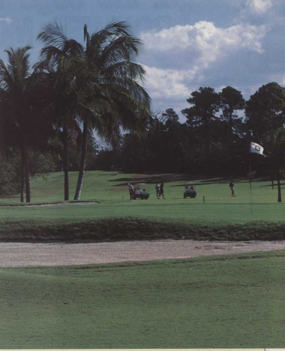
The picturesque 13th hole on the Ruby sports native royal palms.

It's not uncommon for workers or guests to pick coconuts and drink the juice, or to nibble on exotic fruits like papaya, mango, Japanese plum (loquat) and Barbados cherry. In fact, the Chinese restaurant at the Interna-