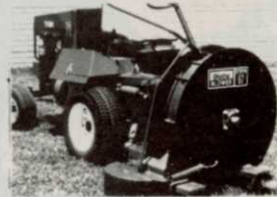
Out Front Attachment For Groundsmaster

Olathe Manufacturing, Inc. 800-255-6438 Industrial Parkway, Industrial Airport, KS 66031 913 787 4396