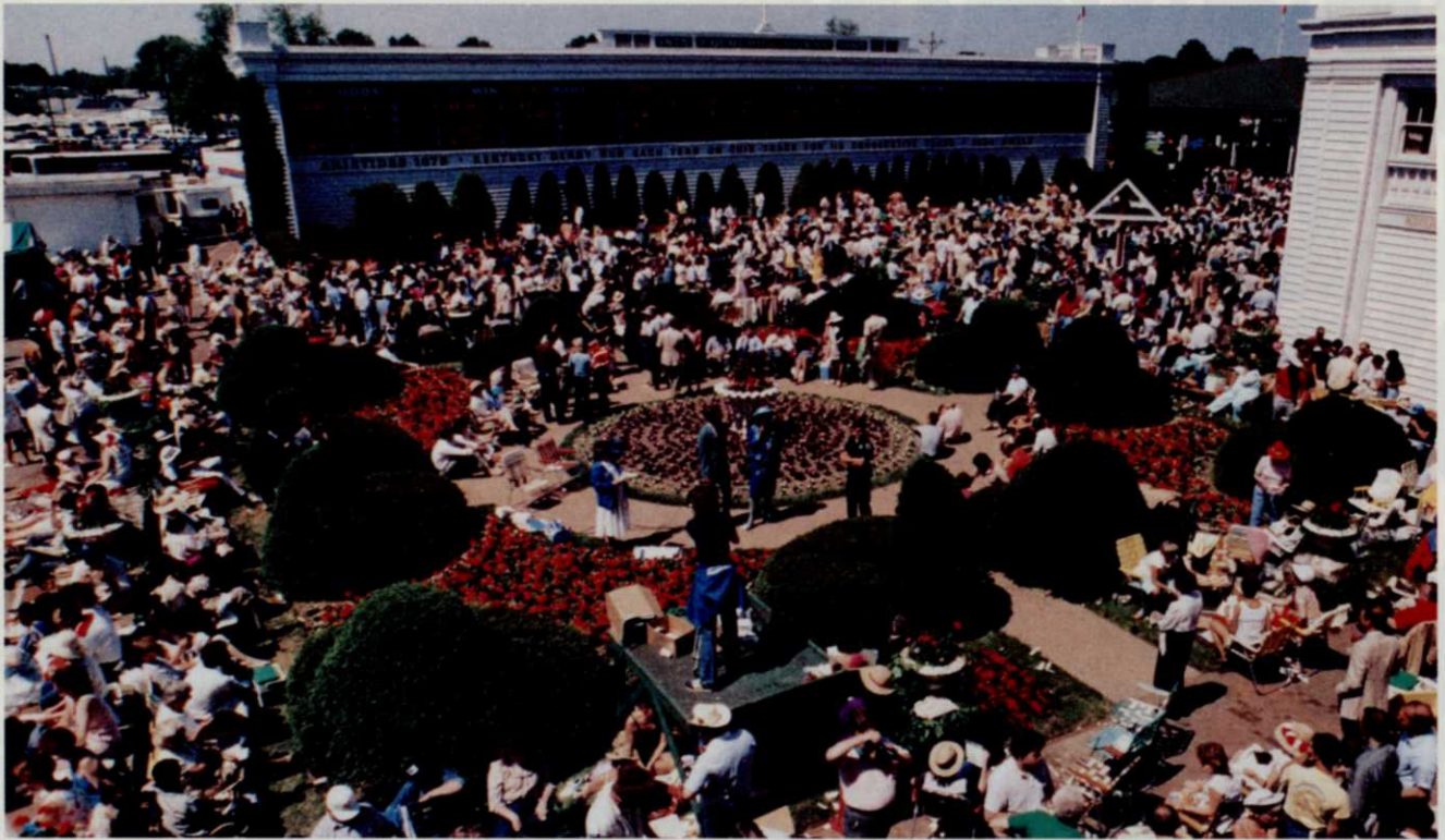
The Churchill Downs' clubhouse garden on Derby Day in 1985.