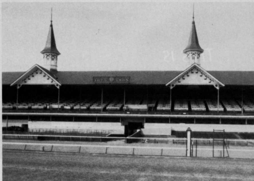
A view of Churchill Downs' famous grandstand and twin spires.