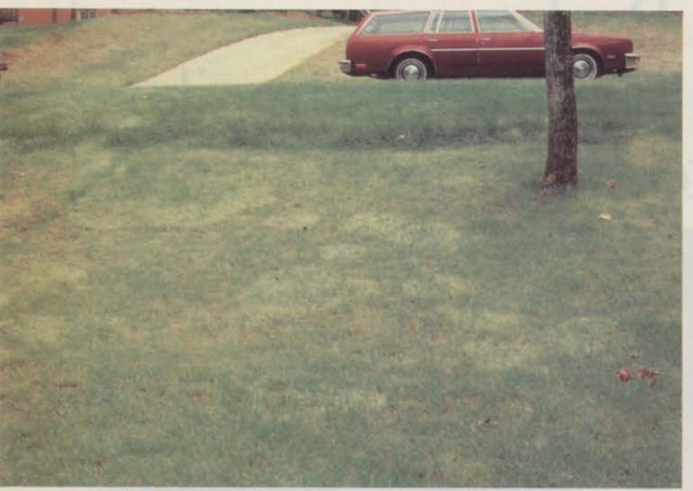
Melanotus white patch is more severe on young tall fescue.

temperatures reach the low 70s (degrees F). When the daily air temperatures move into the mid 80s, infection rates increase significantly and the extent of colonization of the leaves by the invading fungus becomes more pronounced.