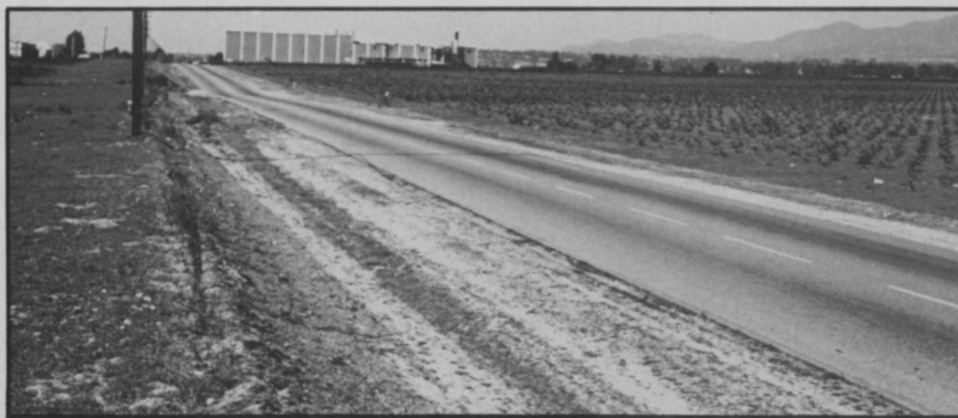
Bare ground next to a roadside is cause for joy in San Bernadino County. This road runs through Rancho Cucamonga.

chemicals still in the tanks are sent back out to spray until empty. "We have no intention of getting into the mass liquid storing business," Gardner promises.