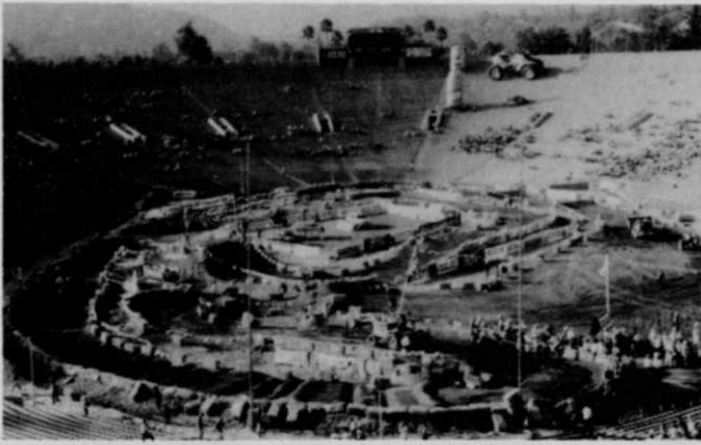
Setting up the field for an auto race.