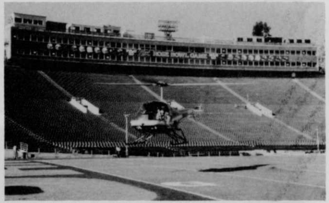
A police helicopter dries the field last New Year's.

grass field, and home of the UCLA Bruins and the New Year's clash between the best of the Big 10 and PAC 10. The so-called "Granddaddy" of bowl games.