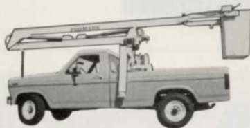
6 models including trucks & trailers.

Feeds from any direction. 360° rotation. Hydraulic feed.