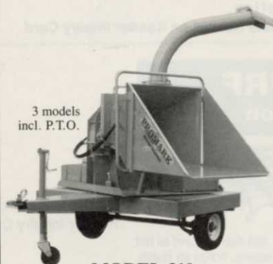
3 models incl. P.T.O.

Grinds stumps to 18" below ground. Under 30" wide.