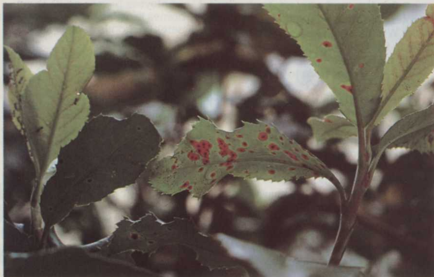
Above, azaleas afflicted with petal blight. Petal blight sometimes affects the blooms of entire plants within a few hours. Below, entomosporium leaf spot of photinia. Once established, the disease is difficult to control.