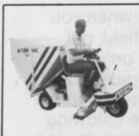
MODEL 80 Sweeps 48" wide