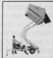
MODEL FM-5 Lifts to Dump 96"