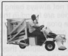
MODEL 70 LD Sweeps 54" wide