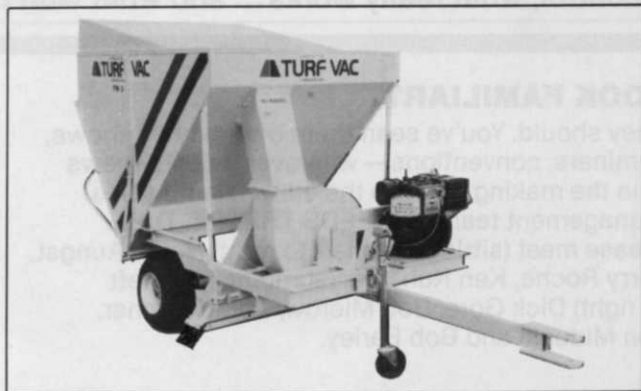
MODEL FM-3. With 4 ft. sweeping width and 11 HP B&S engine. Ideal for landscaping maintenance and other general purpose sweeping.