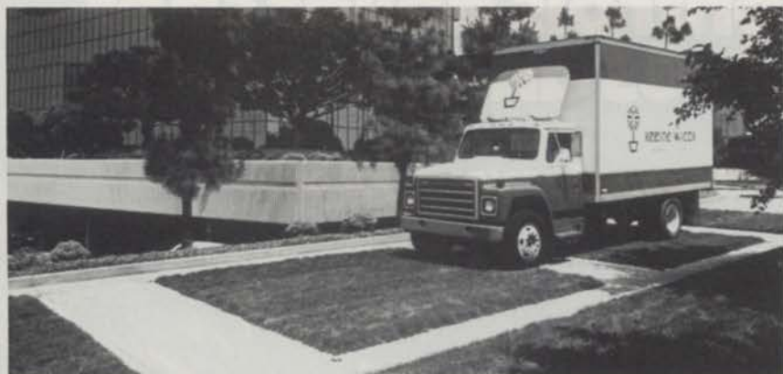
Grasscrete, "the only option in lieu of concrete or asphalt," as it looks installed at the Ritz-Carlton Hotel in Laguna Niguel, Calif.

Grasscrete is installed by a nationwide network of specially-trained and equipped contractors licensed by the Bomanite Corp. WT&T