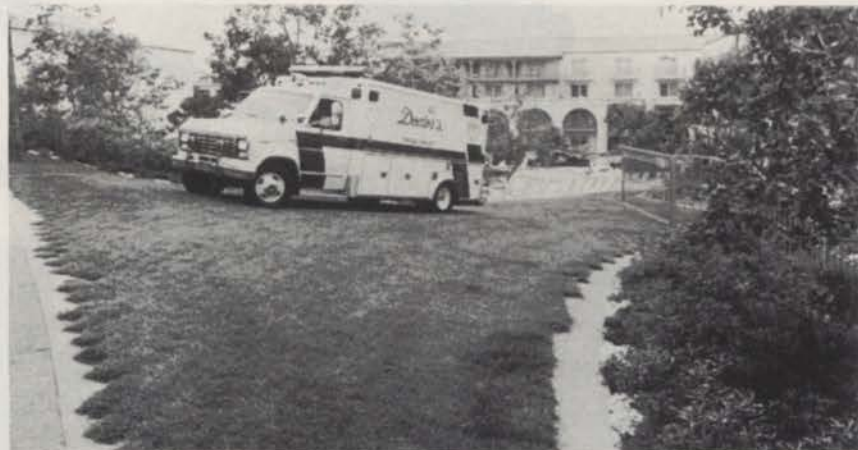
The Clauset Centre in Costa Mesa, Calif, where Sullivan Concrete Textures of Costa Mesa performed the installation.

O'Keefe says the bluegrass/fescue continued on page 58