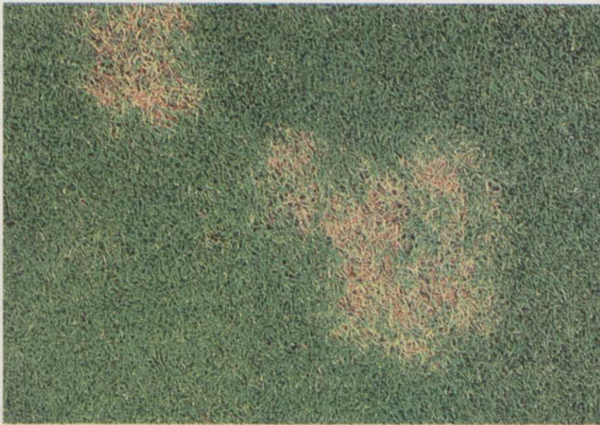
Annual bluegrass infected with summer patch.

production of new, juvenile growth which should be more resistant to heat stress. Coring should follow a week or two later for good root growth.