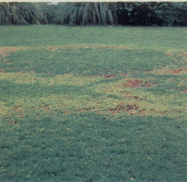
A developed case of fairy ring on centipede grass.