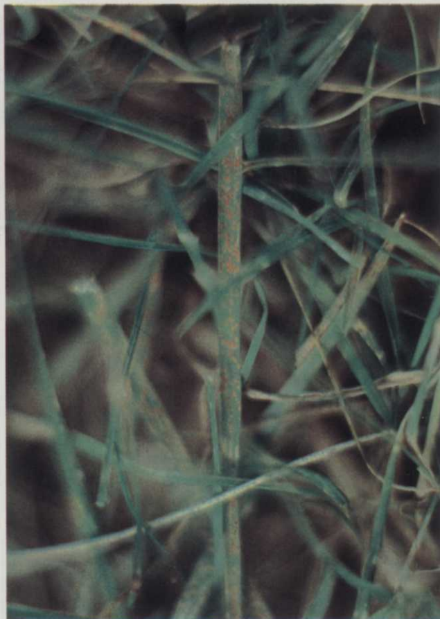
Rust on zoysiagrass.