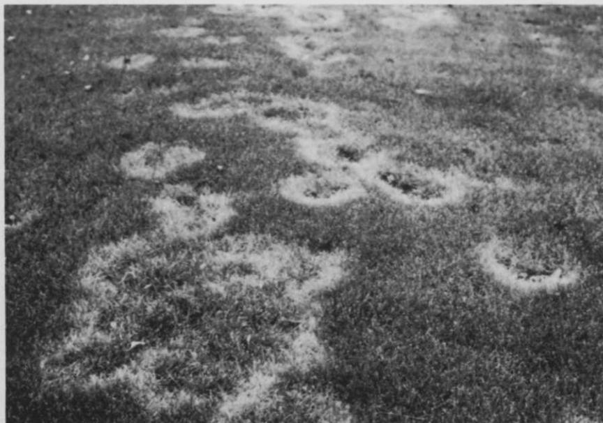
Necrotic ring spot on Kentucky bluegrass.

or severely damaged during this period, which is where the term melting out arises. The entire stand of Kentucky bluegrass seems to melt away.