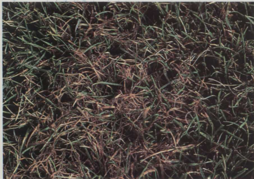
Red thread on perennial ryegrass.