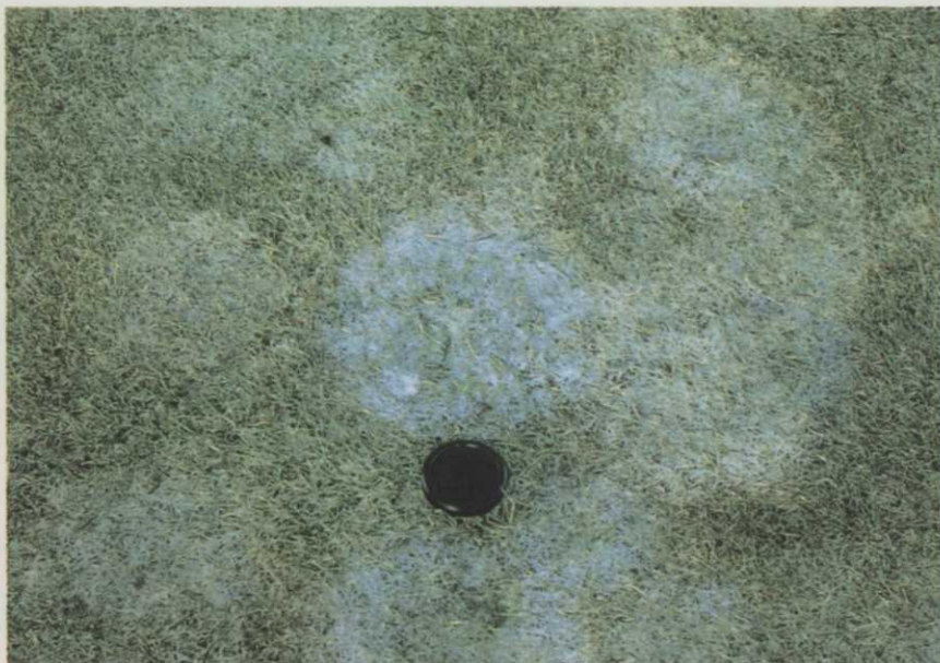
Typhula blight or gray snow mold.