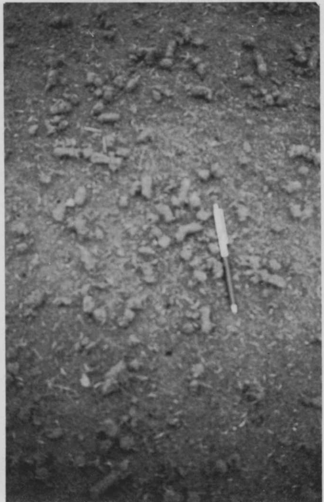
Aerifier plugs after dragging.