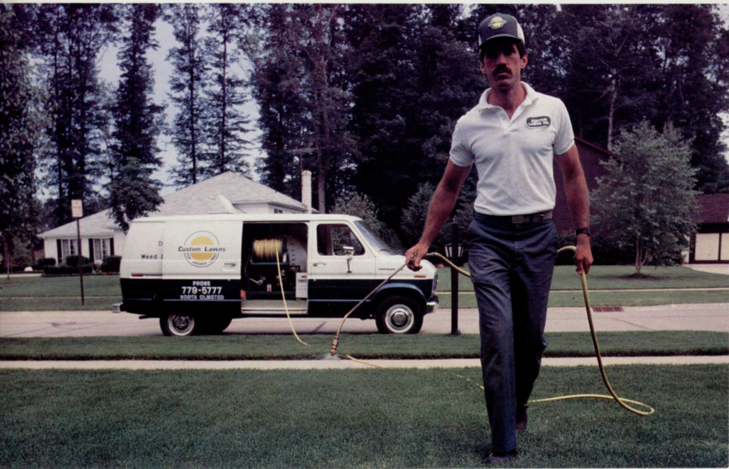
Liquid-applied weed control on home lawns

Team is now available on an easy-tospread clay particle from Elanco. Team sprayable and Team in combination with granular fertilizers will be available in early 1986 through selected formulators.