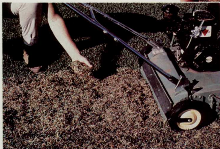
Power raking combined with core cultivation was the preferred method of reducing excessive thatch accumulation in a study at the University of Nebraska.