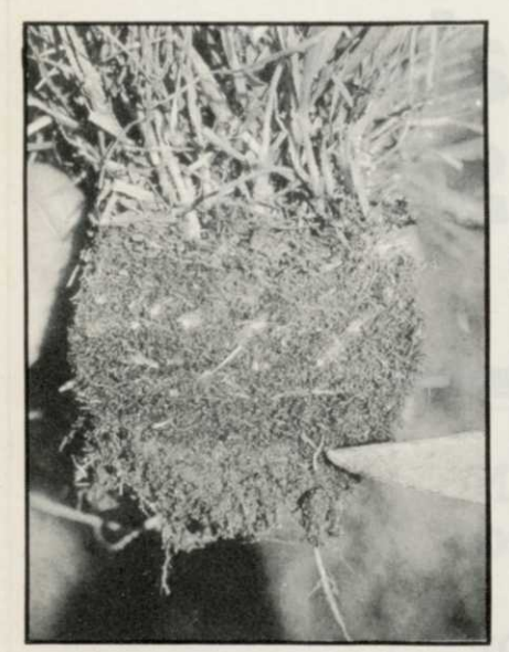
24 Thatch: Friend or Foe?

The Magazine of Landscape and Golf Course Management Since 1962